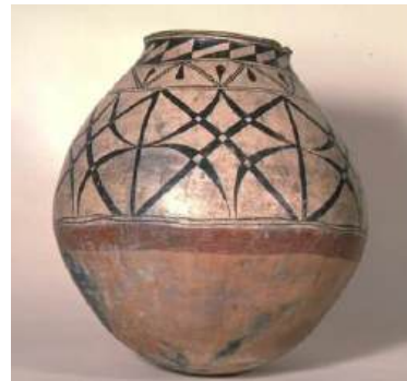
Artist Once Known, c1780