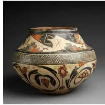
Tonia Vigil, c1880