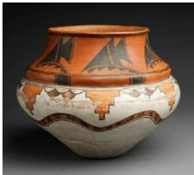
Julian and Maria Martinez, 1917