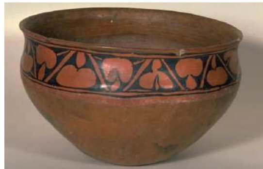
Tonita Roybal, c1915