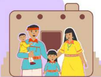
Pueblo De San Ildefonso Home Visit Program