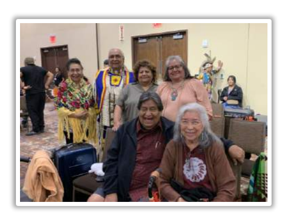
Above: Gonzales Family 2024 NATI Pow Wow