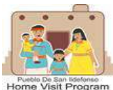
Pueblo De San Ildefonso Home Visit Program