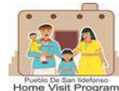
Pueblo De San Ildefonso Home Visit Program