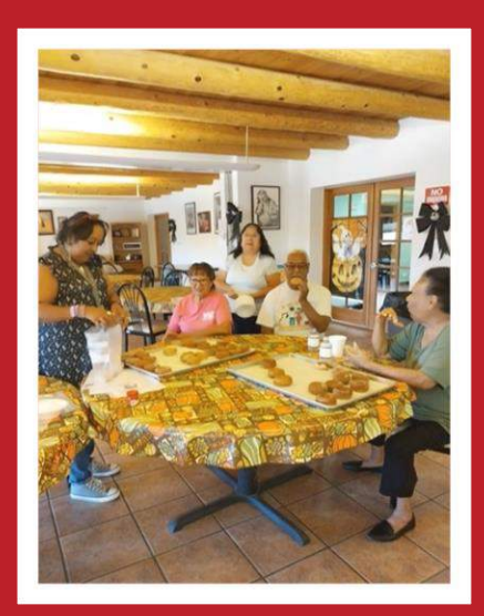
Some senior GOTTA MAKE THE DONUTS!