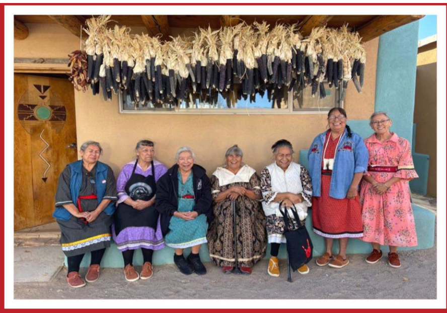
San Ildefonso Pueblo Piki Bread Ladies