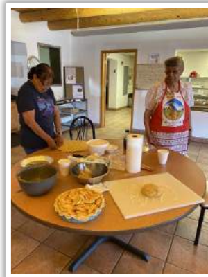
Apple Pie making! Yummy!

San I seniors enjoyed making apple pies both deep dish and Indian pie made type pies. We baked them and had a slice with vanilla ice cream. What a treat! We even had an official taster. The following week seniors were back at the dining area making tamales! We learned how to make the masa and filling and put it all together! Some surgery was needed on some tamales, but we learned that too! Tying, stuffing, folding etc. There were big, small, short, long, fat, skinny tamales! We cooked some and ate with pinto beans, all our hard work was