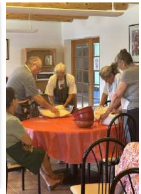
Tamale making! Ate with fresh cooked pinto beans!